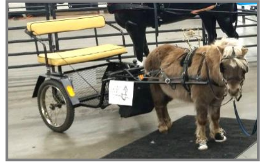
Mr. Truck hitched and ready for a carriage driving demonstration at EXPO 2018