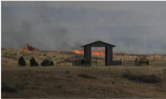
Burning Tree Fire 2011