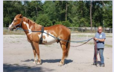
No, that's not Joe. It's just a picture of Long-lining

Clinic will start at 9:30 am with lecture/demonstration (bring a chair!) There will be a break for lunch (bring your own!) The afternoon will be spent with hands-on sessions