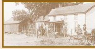
A photo of the 20-Mile House.