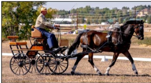
Dressage / Cones

(Exchangable rear, wooden fenders, wooden dashboard, rear disk breaks, dark blue, cherry wood)