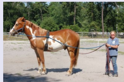
No, that's not Joe. It's just a picture of Long-lining

The afternoon will be spent with hands-on sessions