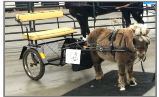
Mr. Truck hitched and ready for a carriage driving demonstration at EXPO 2018