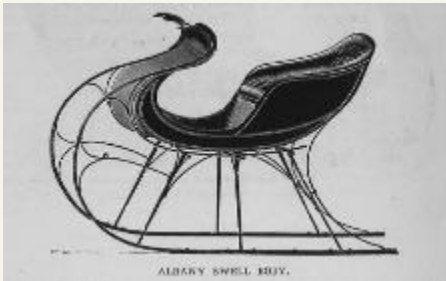
ALBANY SWELL BAY.