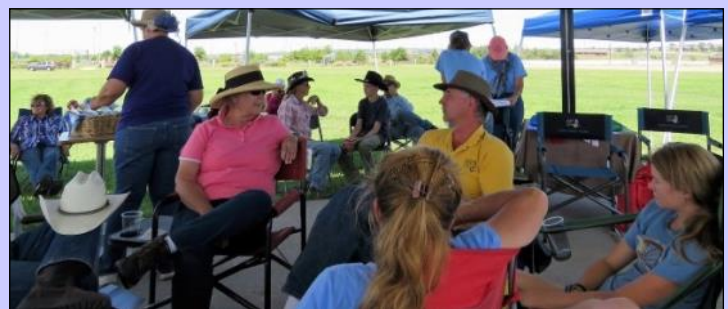
Competitors and Volunteers