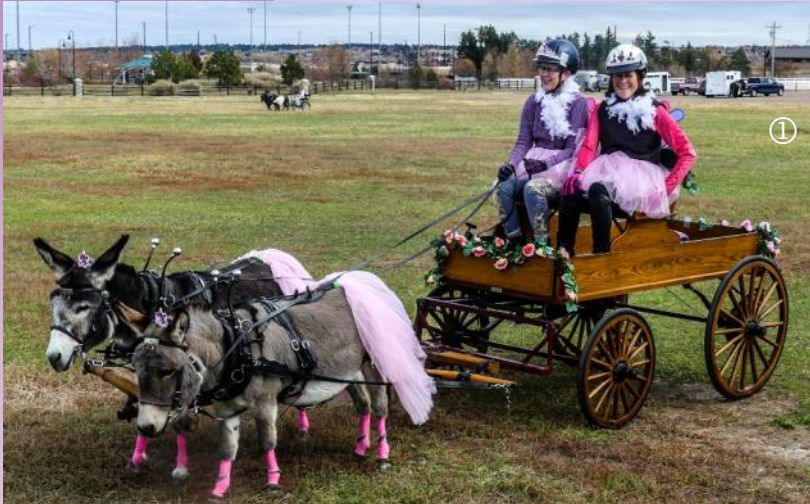
This link will take you to a slide show: https://adobe.ly/2zeATUp